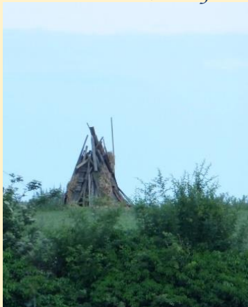
We built a beacon.