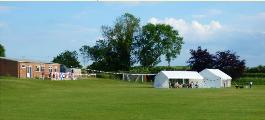
At last, the pavilion and field were ready.