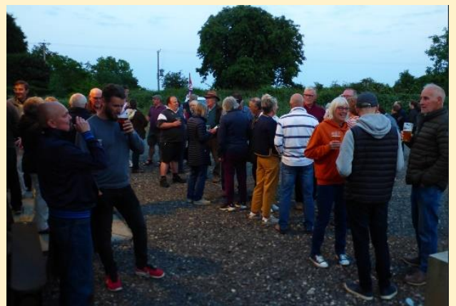
The crowd waited with anticipation.