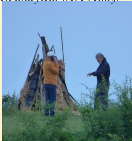
We awaited the appointed time