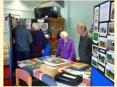
We discussed our memories