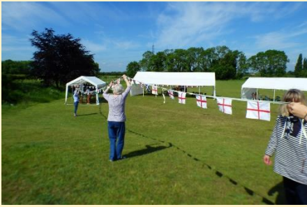
We decorated the field.....and our homes