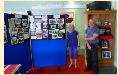
We displayed memorabilia