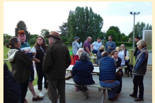
So, we socialised.