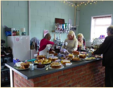
Many of you made cakes