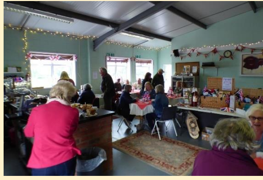
Lots of us ate cakes